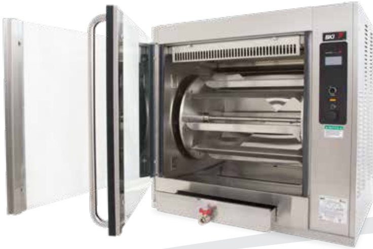
VGG-8-F model shown

Ideal for supermarkets and high-volume restaurants, the BKI® VGG-8-C has an extra-large cooking capacity that will meet growing customer demand and improve profitability. This rotisserie can cook up to up to 40 3-lb (1.36 kg) chickens in 75 minutes. The results are delicious—moist and tender inside and perfectly golden brown outside.