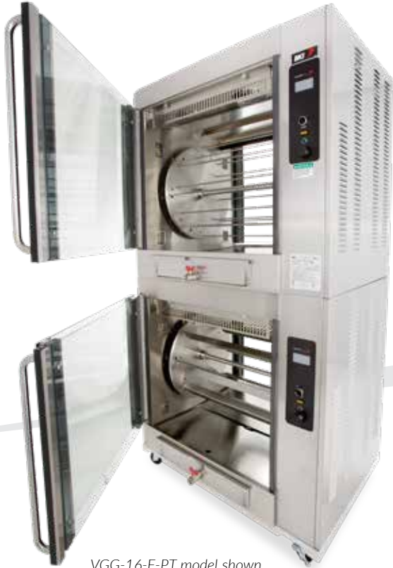
VGG-16-F-PT model shown

Ideal for extremely high-volume supermarkets and restaurants, the BKI® VGG-16-C has a massive cooking capacity that will meet growing customer demand and improve profitability. This rotisserie can cook up to up to 80 3-lb (1.36 kg) chickens in 75 minutes. The results are delicious—moist and tender inside and perfectly golden brown outside.